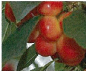
Rainier cherries grow in abundant sunlight.

Rainier cherries are cultivated in Washington State in the US. Different than the dark red cherries you often see in Japan, Rainier cherries are a colorful mix of yellow and red, rather large, and juicy with greater sweetness than other cherries. They are similar in sweetness and flavor to Satonishiki cherries from Yamagata. Rainier cherries are also called “American Satonishiki.” As the harvest period is just a month from June to July, Rainier cherries are rare and not widely available, giving them the nickname the “diamond of fruits.”