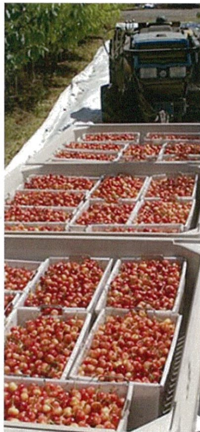
Hand-picked cherries are carried with care.

Rainier cherries are carefully picked by hand and are sent directly to a packing facility. Specialized staff carefully selects and packs them, and then the Rainier cherries are sent to our customers.