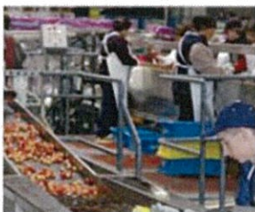
The process is done by floating the cherries in the water to minimize damage.

Rainier cherries are carefully picked by hand and are sent directly to a packing facility. Specialized staff carefully selects and packs them, and then the Rainier cherries are sent to our customers.